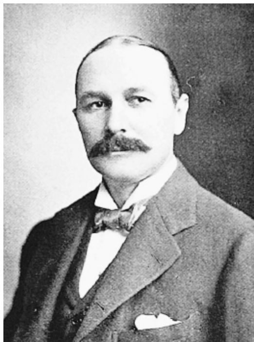
Charles Blair Macdonald

It was Macdonald who invented out of bounds. Before he came along, an errant shot was tracked down and played, no matter whose cornfield or cow pasture it had sailed into. Macdonald saw that as impractical, plus he was a slicer, and when he laid out the 18 holes of Chicago Golf Club in Wheaton in the early days of 1895, he just happened to lay them out on the edge of the property, clockwise, so anyone hooking the ball might send it over the fence, while his miscues could be played from the light fescue rough.