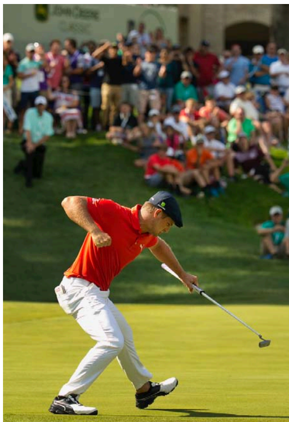
John Deere Classic

Deere pumped money into the purse. Tourna-